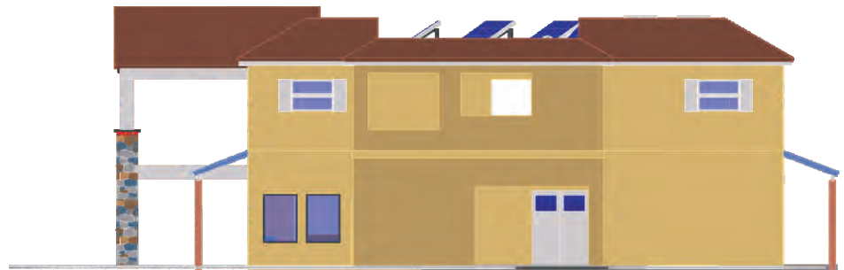
EAST ELEVATION (approx. 52'us.ft. / ±69' with porches)

The security and overseer's offices have immediate access to the cafeteria as well as clear views of the front gate, parking, and driveway.