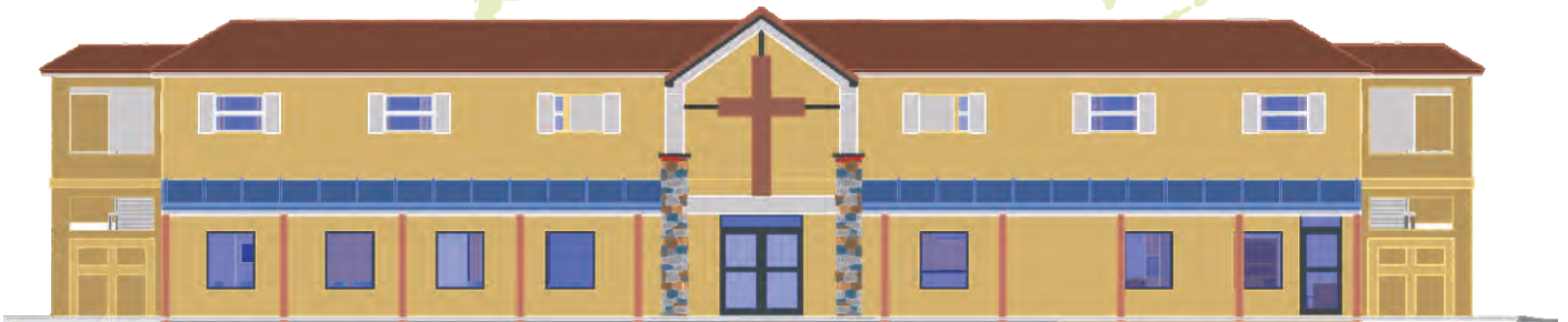
FRONT ELEVATION (approx. 96'us.ft. / ±112' including stairwells)

The community can enjoy meals together on occasion in this 100 seat cafeteria, served by a large commercial size kitchen with serving counter. The pantry, storage, and walk-in cooler provides ample ability to stock food not just for the community, but the local population as well.