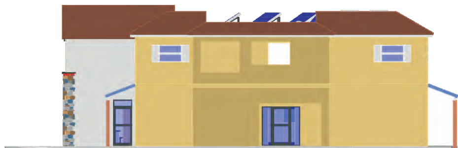
EAST ELEVATION (approx. 52'us.ft. / ±69' including foyer)

A secure entrance and private meeting room is provided for singers, musicians and speakers.